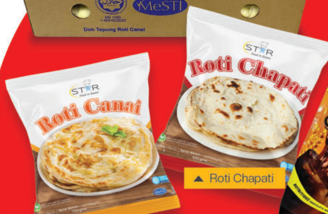
▲ Roti Canai (Frozen)