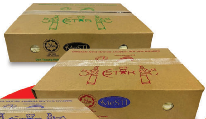
▲ Doh Tepung Roti Canai